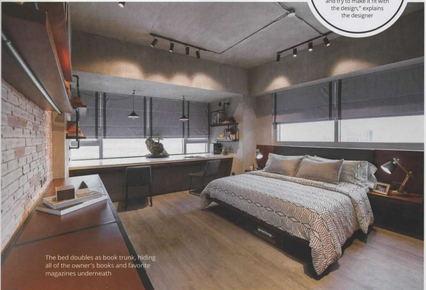
The bed doubles as book trunk, hiding all of the owner's books and favorite magazines underneath

"When you're doing a renovation, work around the things that could still be salvaged. You have to see the things that will match and try to make it fit with the design," explains the designer